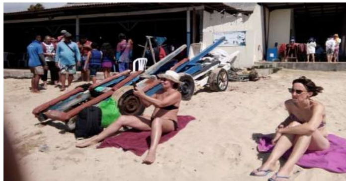
Photo 6: Foreign tourists also like to take pictures while sunbathing activities at Tanjung Bena Beach (Doc: Sumadi, 2018)