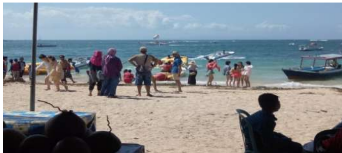
Photo 5: More and more tourists are increasingly crowded visiting Tanjung Bena Beach marine tourism area