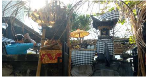
Photo 4: The Temple at Tanjung Bena beach for praying Hindu Women before massage serviced

Susila Hindu's teachings are free from negative images