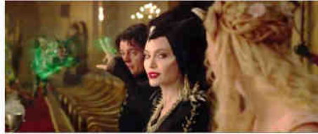
Figure 10. Maleficent froze the cat

Source: Maleficent: Mistress of Evil (2019)