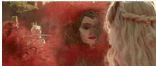
Figure 12. Maleficent's demise at the hand of Queen Ingrith.