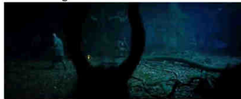
Figure 9. Maleficent's horns