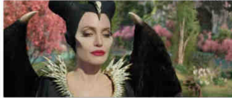
Figure 3. Maleficent's expression when accepting Aurora's veil