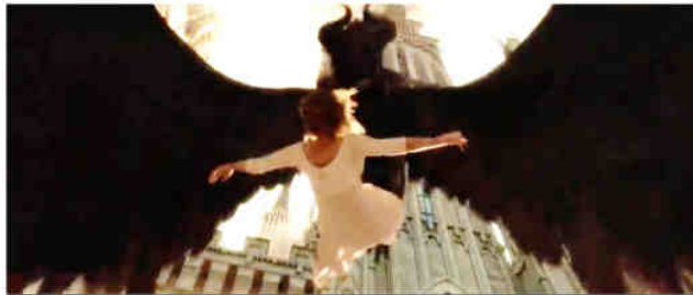
Figure 13. Maleficent rescued Aurora