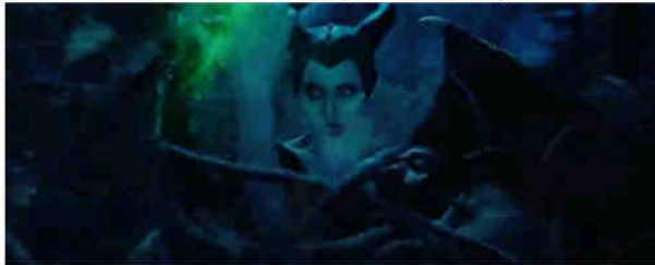
Figure 11. Maleficent created a protective cage from the roots

Source: Maleficent: Mistress of Evil (2019)