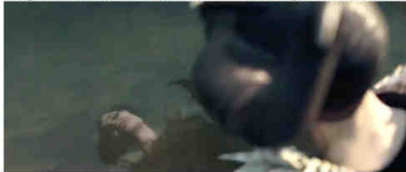
Figure 2. Diaval trained Maleficent to greet and smile