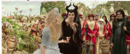
Figure 7. The wedding was attended by humans, fairies, and feys in peace