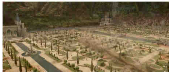
Figure 14. Maleficent crashed into the park to save Aurora.