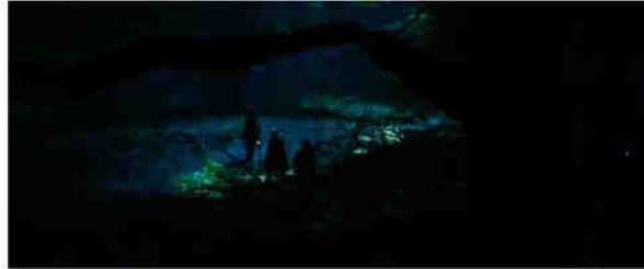
Figure 8. Aerial point of view of the thieves