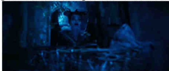
Figure 6. Maleficent looking at Aurora's crib in the fairies' house

Source: Maleficent: Mistress of Evil (2019)