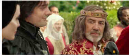
Figure 5. King John and Maleficent exchanged an amiable smile.